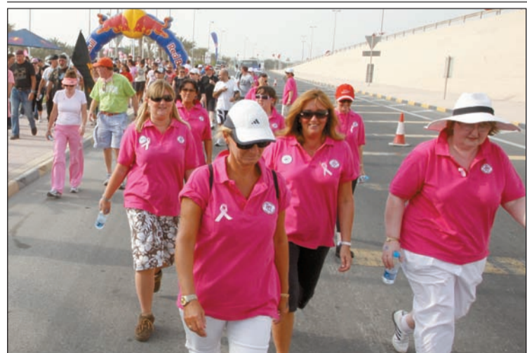
More than 500 people took part in a walkathon yesterday to raise funds to help sick children and fight breast cancer. The Rotary Pink Walkathon, organised by the Rotary Club of Adliya, raised more than BD2,000 in support of 'The Gift of Life Bahrain' project and Think Pink Bahrain. Above, walkers at the event. Full report - Pages 6-7

The global financial crisis saw a slow-down in demand for new property developments. However, a study by Business Monitor International forecast nearly 7pc growth in the sector this year with $80 billion (BD30bn) worth of infrastructure projects currently underway, says the report.